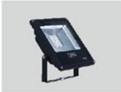
20W LED Flood Light