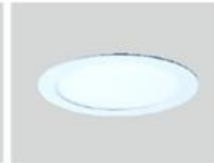
LED Down Light 3 in • 6 in • 8 in