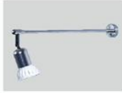
6W LED Modular Arm Spot Light