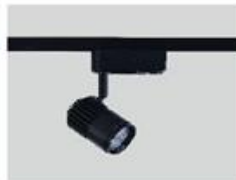
10W LED Track Light

Stocks are subject to availability. Dimensions are approximate and in inches (in) and feet (ft).