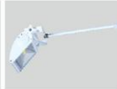
70W LED Arm Flood Light