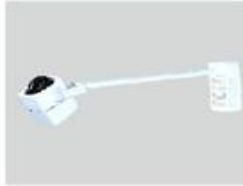
50W Halogen Arm Spot Light