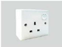
13amp Power Socket (up to 800W)