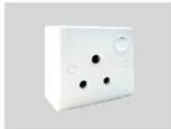
15amp Power Socket (up to 3kW)

Stocks are subject to availability. Dimensions are approximate and in inches (in) and feet (ft).