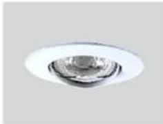
Down Light 3 in