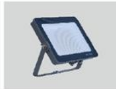
100W LED Flood Light