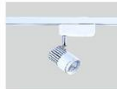
10W LED Track Light