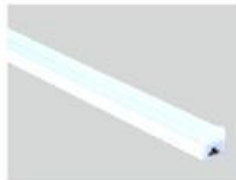
LED T8 Tube Light 2 ft • 3 ft • 4 ft