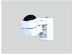
50W Halogen Spot Light