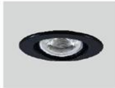
Down Light 3 in