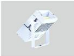
70W Flood Light