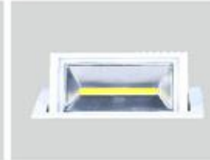
70W LED Recessed Flood Light 9.44 x 5.66 in