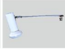
10W LED Arm Spot Light