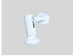
10W LED Spot Light