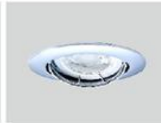
Down Light 3 in