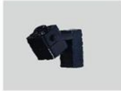
50W Halogen Spot Light