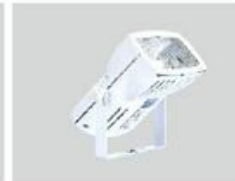
150W Master HQ! Flood Light