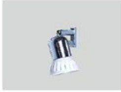
6W LED Showcase Spot Light